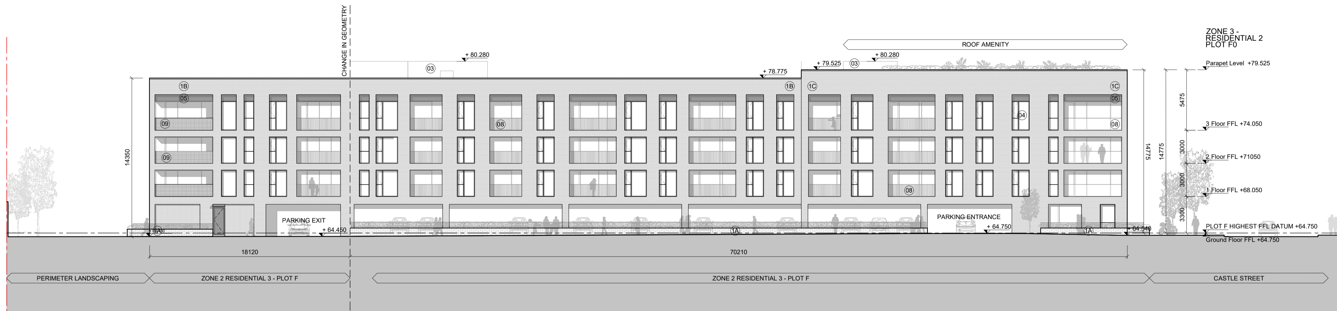
3 SOUTH EAST ELEVATION F400 SCALE: 1:200