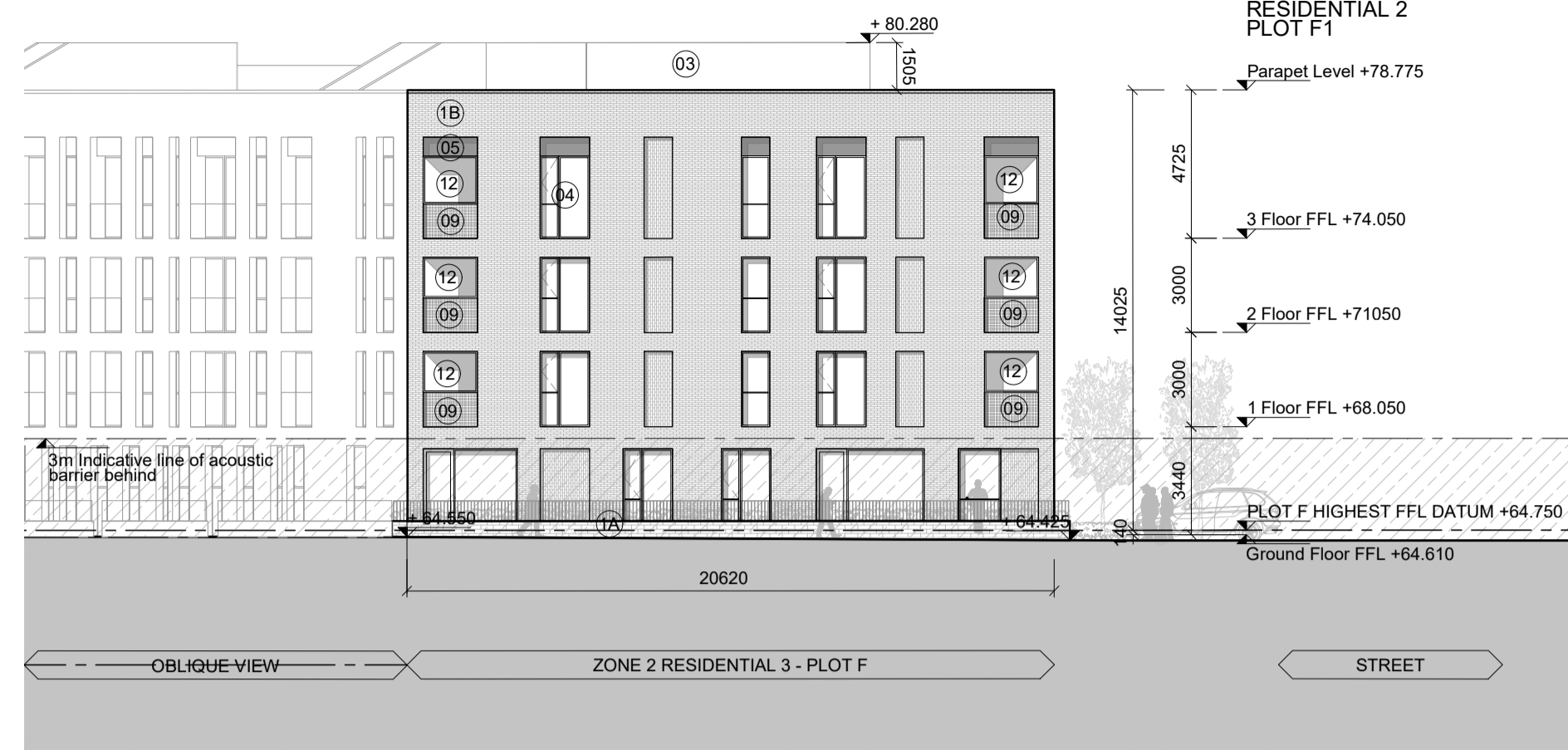
2 SOUTH ELEVATION F400 SCALE: 1:200