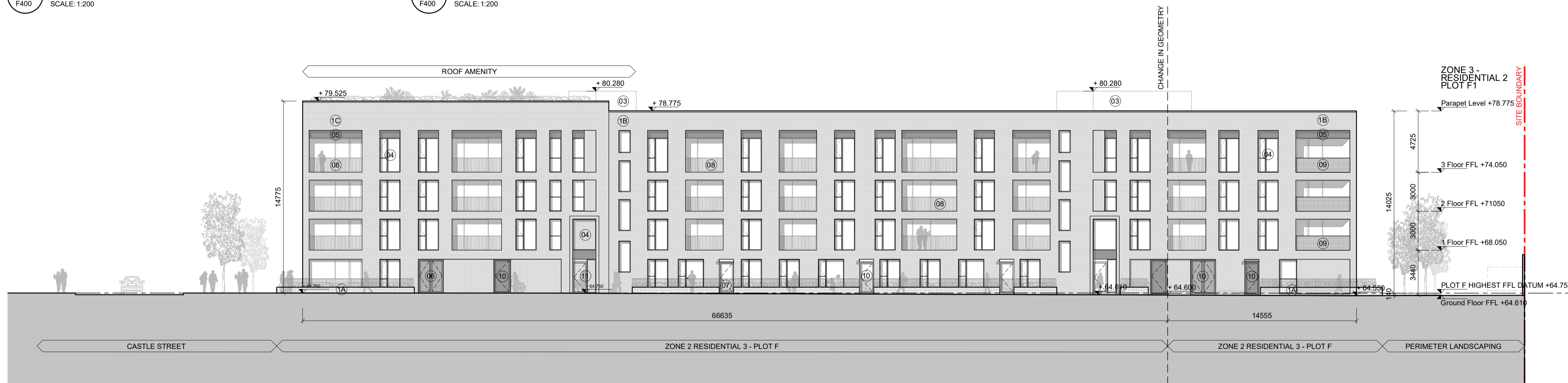
5 WEST ELEVATION F400 SCALE: 1:200